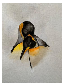
'Mate For Life' Watercolour