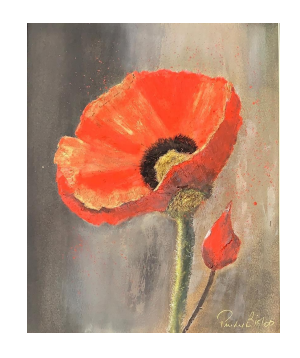
'Just A Poppy' Pan Pastel & Watercolour