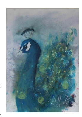
'Proud As A' Mixed Media

I take a weekly walking group which was set up in 2015 which of course always finishes with a tea or coffee!